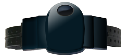
BLUband® RF Transceiver