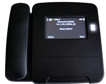
BLUhome® RF Receiver