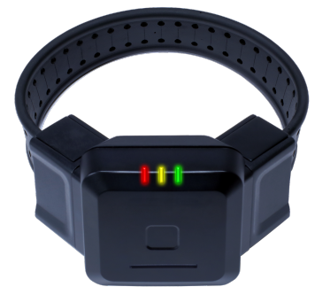
BLUtag® GPS Device